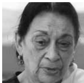
Smt. Uzra Butt

Smt. Uzra Butt , eminent Urdu theatre actor who received the Sangeet Natak Akademi Award in 1994, passed away on 31 May 2010.