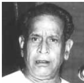
Shri Bhimsen Joshi

Shri Bhimsen Joshi eminent Hindustani Vocalist passed away on 31 January 2011. He was elected Fellow of the Akademi in 1998.