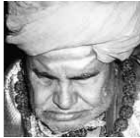
Shri Puttaraj Gavaigalu