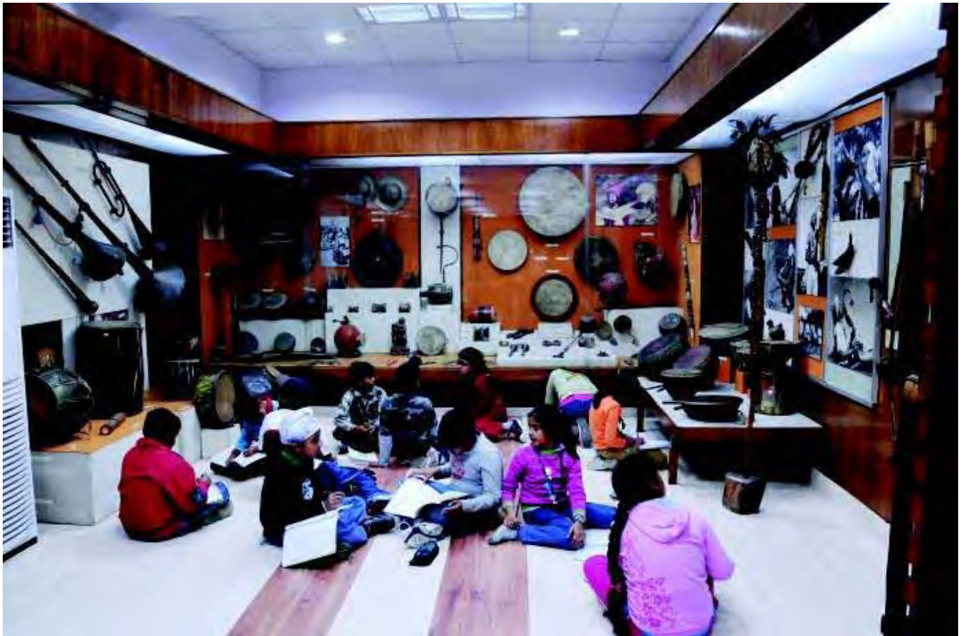
School children at the museum.