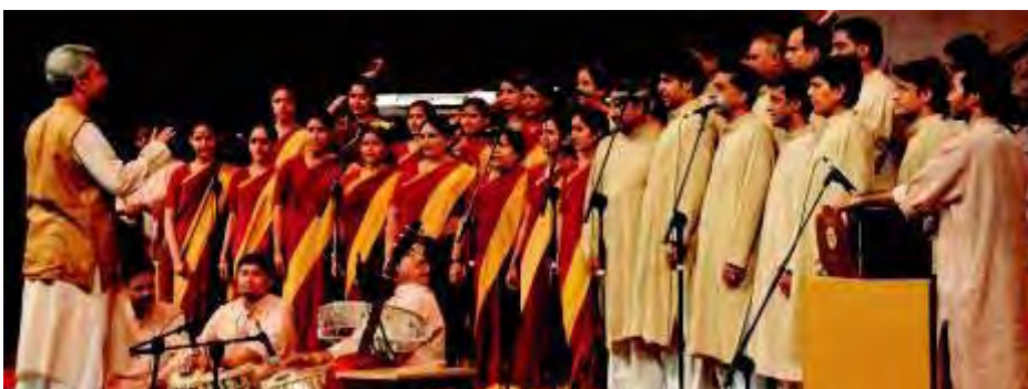
Middle: Madras Youth Choir, Chennai. Bottom: Gandharva Choir, Delhi.