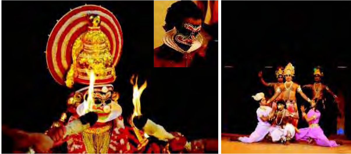
Top left: Kutiyattam recital by Kutiyattam Kendra, Thiruvananthapuram.