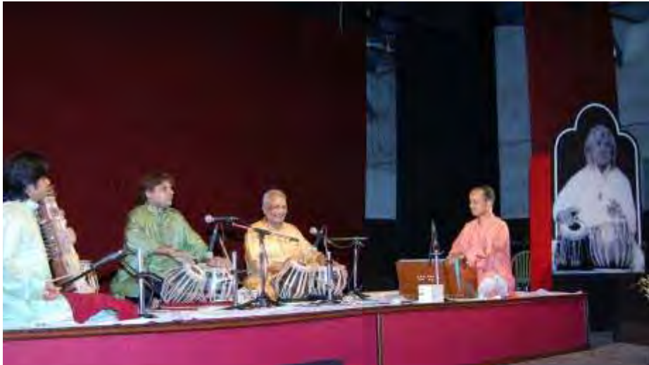
TABLA MAHOTSAV KOLHAPUR