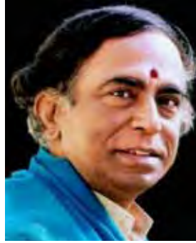
Lalgudi G. Jayaraman