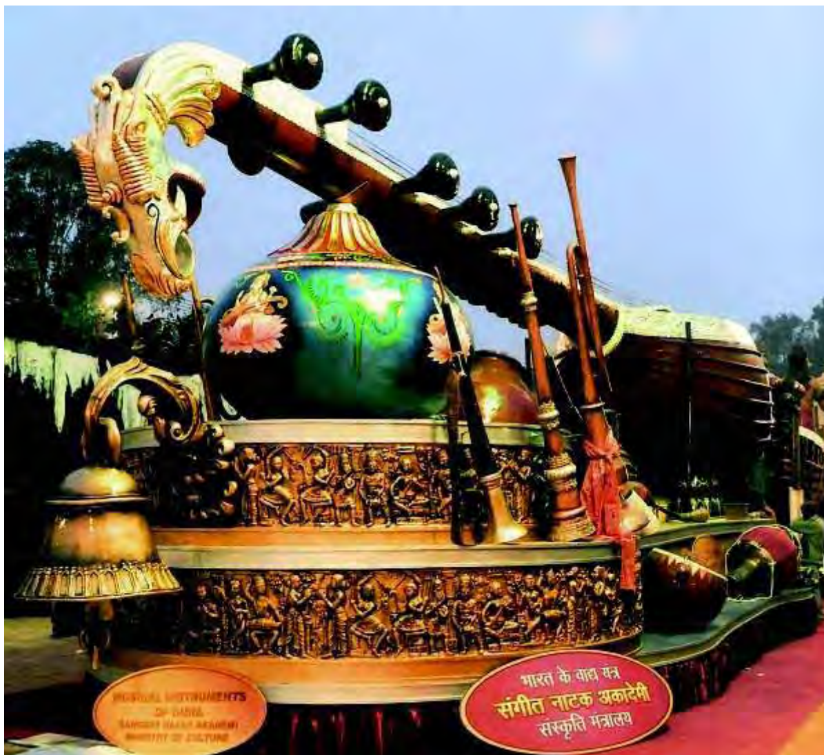
Tableau on musical instruments of India designed by Sangeet Natak Akademi at the Republic Day Parade 2010 in New Delhi. The tableau was awarded the first prize by the Ministry of Defence.