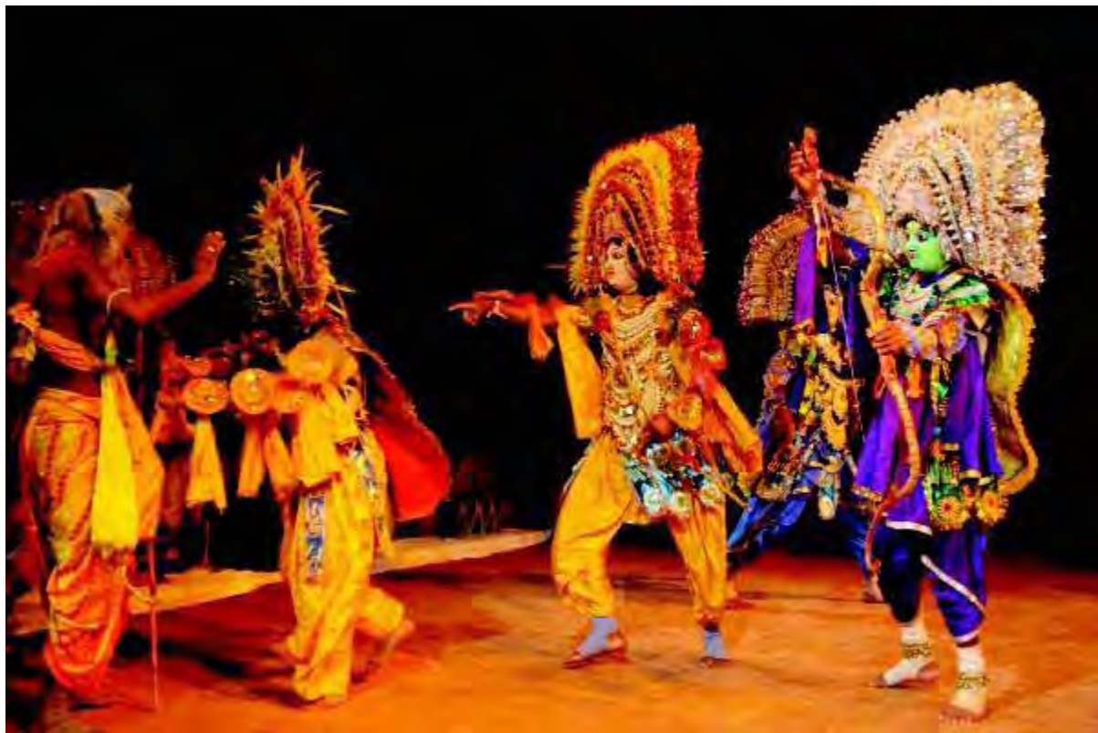
Bottom: Purulia Chhau dance by Chhau Kendra.