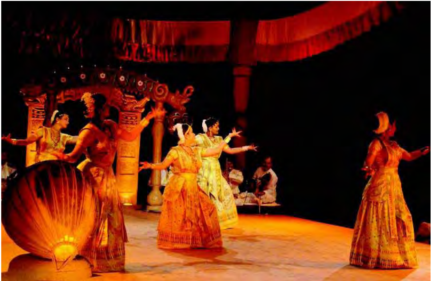
Sattriya dance performance by Sattriya Kendra, Guwahati.