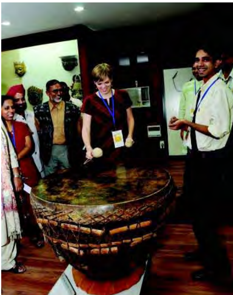
Top and bottom: A team from the International Centre for the Study of the Preservation and Restoration of Cultural Property (ICCROM), Italy, on a study visit to Sangeet Natak Akademi, New Delhi on the 18th of November, 2009 as part of the Sound and Image Collections Conservation (SOIMA) programme of ICCROM.